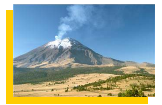
Plate tectonics is a unifying geologic theory that explains the formation of major features of Earth's surface and important geologic events. Sixth-grade students learn about the evidence of past plate tectonic movement and about landforms and topographic features—such as volcanoes, mountains, valleys, and mid-ocean ridges—generated by plate movement. They discover that major geologic events, such as earthquakes, volcanic eruptions, and mountain building, result from plate movement and often occur at the boundaries of the plates.

Students also learn that Earth is composed of three distinct layers: